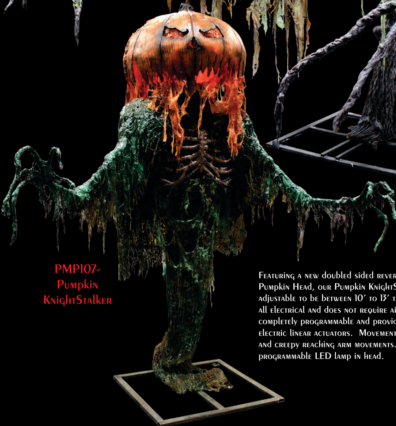
PMP107- Pumpkin KnightStalker

FEATURING A NEW DOUBLED SIDED REVERSIBLE SCULPTED PUMPKIN HEAD, OUR PUMPKIN KNIGHTSTALKER IS HEIGHT ADJUSTABLE TO BE BETWEEN 10' TO 13' TALL. CHARACTER IS ALL ELECTRICAL AND DOES NOT REQUIRE AIR. MOVEMENTS ARE COMPLETELY PROGRAMMABLE AND PROVIDED BY HI-POWERED ELECTRIC LINEAR ACTUATORS. MOVEMENTS INCLUDE HEAD PAN AND CREEPY REACHING ARM MOVEMENTS. INCLUDES PROGRAMMABLE LED LAMP IN HEAD.