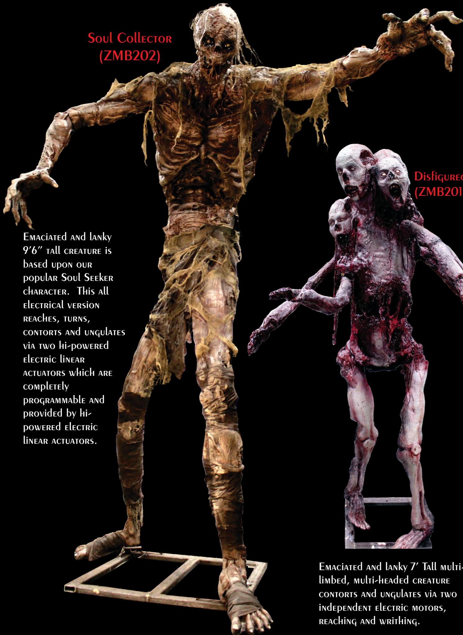
Soul Collector (ZMB202)

EMACIATED AND LANKY 9'6" TALL CREATURE IS BASED UPON OUR POPULAR SOUL SEEKER CHARACTER. THIS ALL ELECTRICAL VERSION REACHES, TURNS, CONTORTS AND UNGULATES VIA TWO HI-POWERED ELECTRIC LINEAR ACTUATORS WHICH ARE COMPLETELY PROGRAMMABLE AND PROVIDED BY HI-POWERED ELECTRIC LINEAR ACTUATORS.