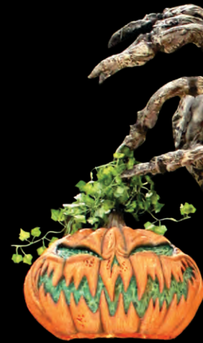
Talking Headless Horseman (CHR322)

STANDING AN IMPRESSIVE 15'6" TALL AND SCALED FROM OUR POPULAR IMPALER SUPER CREATURE, OUR GIANT PUMPKIN LORD FEATURES A MODIFIED PUMPKIN KING HEAD WITH BUILT IN FOGGER AND GREEN GLOWING HIGH INTENSITY LED'S THAT LIGHT MOUTH AND EYES AS FOG ESCAPES OVERLY LARGE CARVED HEAD. MOVEMENTS INCLUDE HEAD ROTATION, JAW, LEFT ARM, RIGHT ARM. CHARACTER HOLDS SECOND LIT LARGE JACK O'LANTERN IN RIGHT HAND.