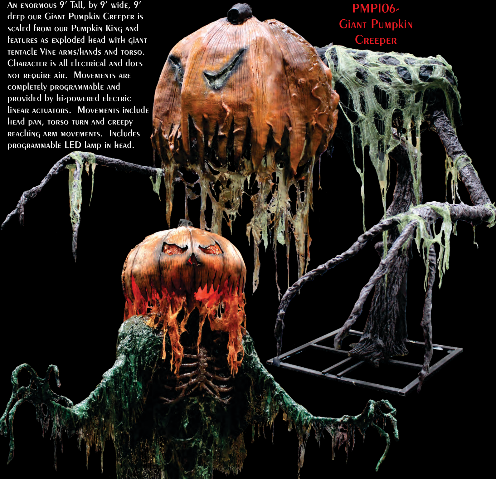
PMP106- Giant Pumpkin Creeper

AN ENORMOUS 9' Tall, by 9' wide, 9' deep OUR GIANT PUMPKIN CREEPER IS SCALED FROM OUR PUMPKIN KING AND FEATURES AN EXPLODED HEAD WITH GIANT TENTACLE VINE ARMS/HANDS AND TORSO. CHARACTER IS ALL ELECTRICAL AND DOES NOT REQUIRE AIR. MOVEMENTS ARE COMPLETELY PROGRAMMABLE AND PROVIDED BY HI-POWERED ELECTRIC LINEAR ACTUATORS. MOVEMENTS INCLUDE HEAD PAN, TORSO TURN AND CREEPY REACHING ARM MOVEMENTS. INCLUDES PROGRAMMABLE LED LAMP IN HEAD.