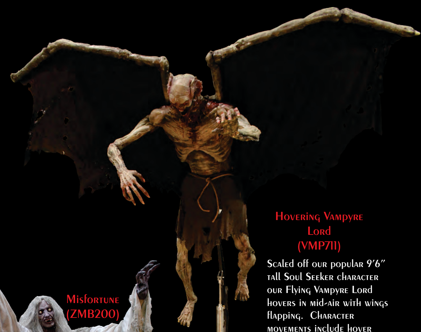
HOVERING VAMPYRE Lord (VMP711)

SCALED OFF OUR POPULAR 9'6" TALL SOUL SEEKER CHARACTER OUR FLYING VAMPYRE LORD HOVERS IN MID-AIR WITH WINGS FLAPPING. CHARACTER MOVEMENTS INCLUDE HOVER UP/DOWN, FORWARD/BACK, WING FLAP, HEAD ROTATION, JAW.